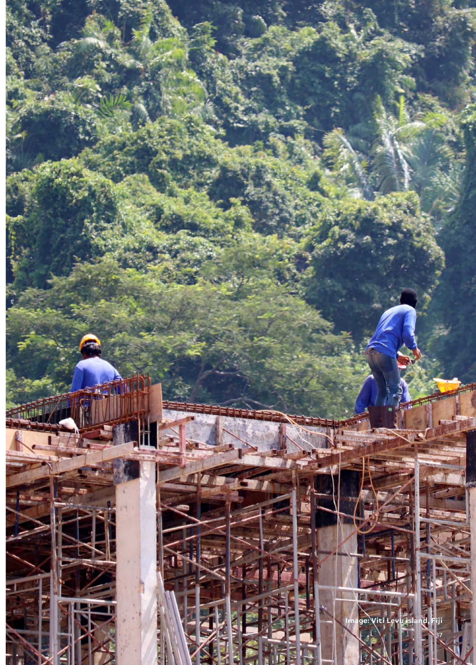
Image: Viti Levu island, Fiji